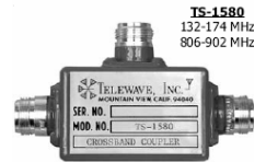
TS-1580 132-174 MHz 806-902 MHz