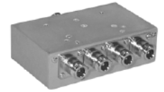
4 Way Splitter